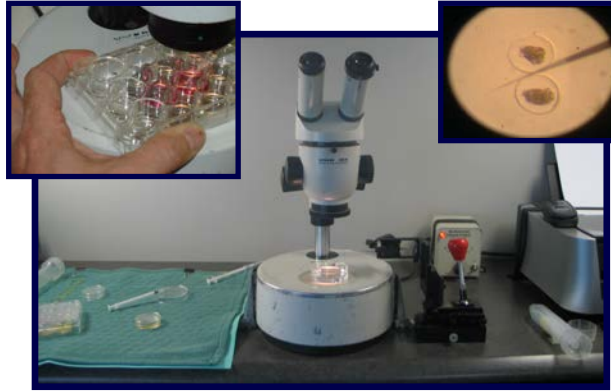
A typical set-up to process embryos.

The use of embryo transfer has simplified and dramatically reduced the costs involved with the import and export of livestock genetics. Entire herds can be transported in a liquid nitrogen tank at a cost that is often lower than that for transporting a single animal.